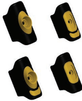
Standard Clips Harsh Environment Clips